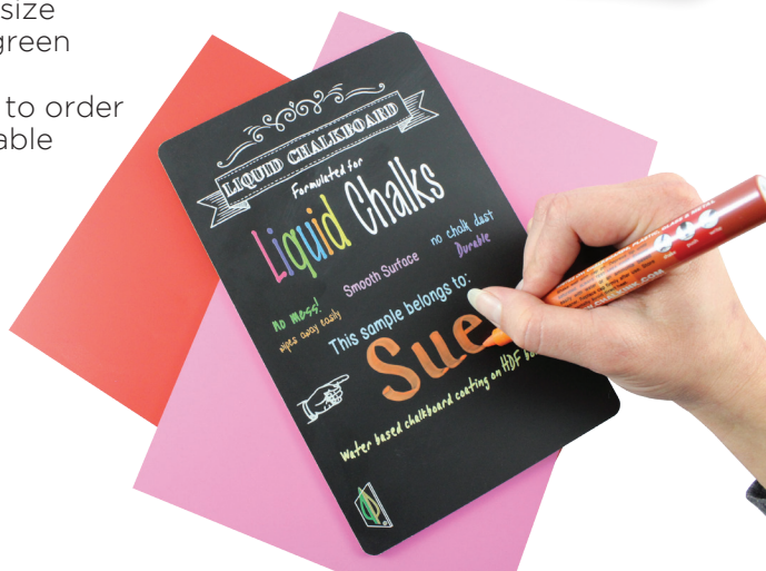
Digital Printing on Chalkboard