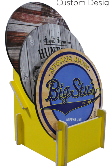
HPL Surface, Custom Design