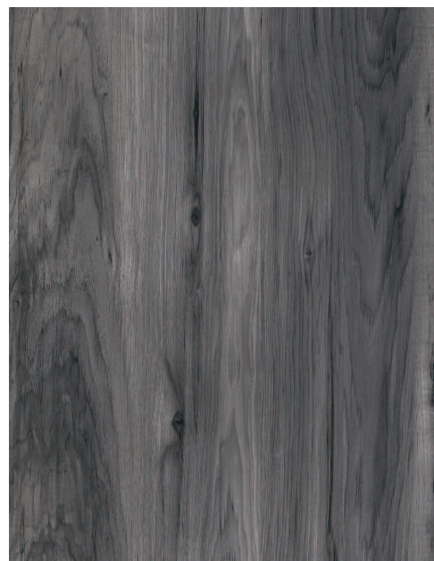
451 DUTTON CREEK