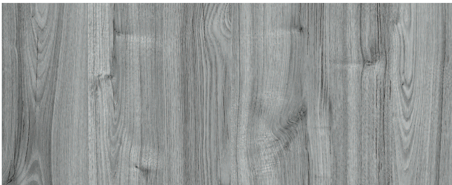
448 STEEL BAY