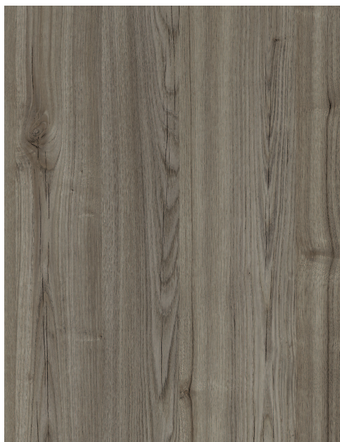
449 UNION PEAK