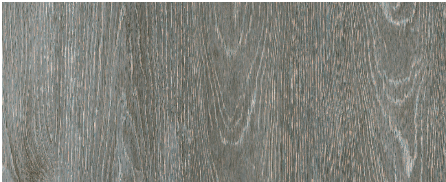
454 PHANTOM SHIP