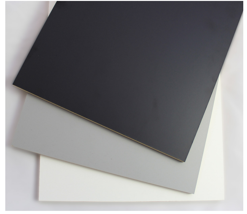
Samples Shown in Black, Galaxy White & Folkstone Gray